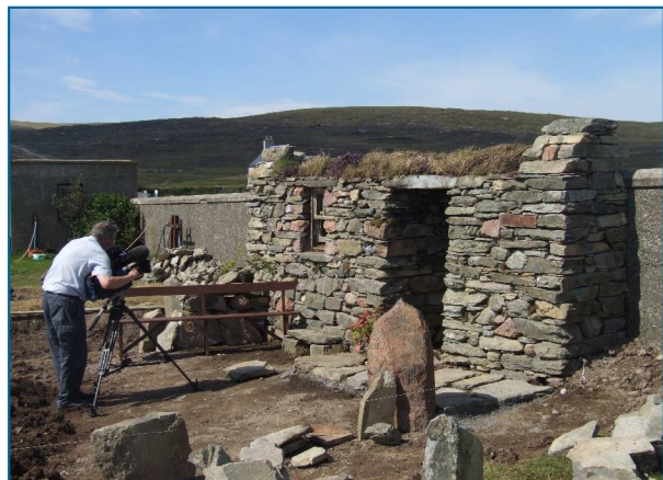
The garden even attracted the attention of the TV cameras!

volunteers have joined the group in recent months, and further offers of help from the Lochend and North Roe community are always welcome. A "to do" list has been put up in the garden shed, meaning that anyone in the community with a little spare time can go along the garden, check the list and carry out any of the jobs they feel they would like to do.